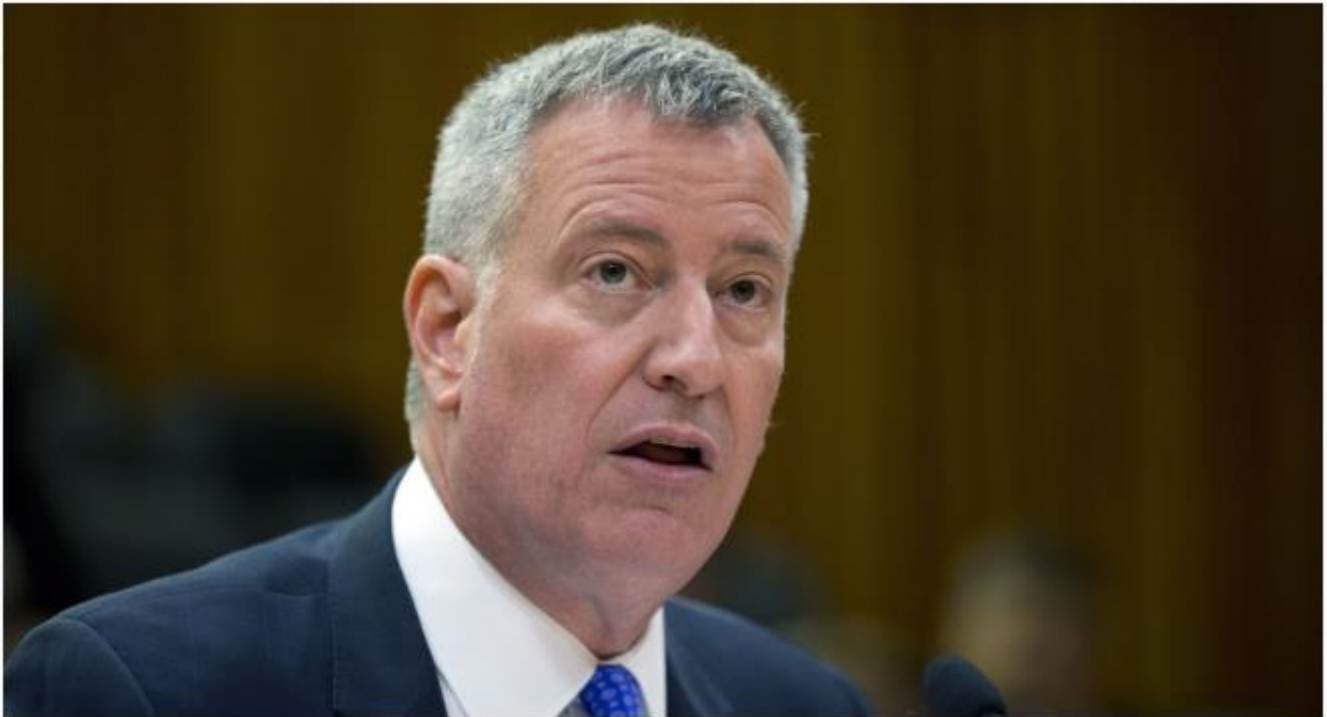
Mayor Bill de Blasio.